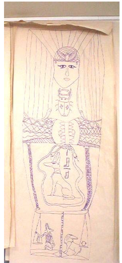
One of a set of multi-layered sarcophagi currently residing in the Owairaka ODS classroom.